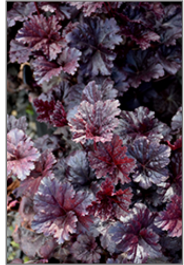
Black Sea Coral Bells foliage

Striking spikes of white bells contrast the mound of large, glossy, black to dark purple foliage with burgundy undersides; amazing contrast to other plants, great versatility; keep soil moist in the heat of summer