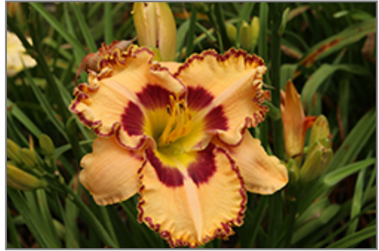
Rainbow Rhythm Lake of Fire Daylily flowers

Spectacular large trumpets are apricot-peach with contrasting orange-red eyezones and edges, accented by yellow picotee margins and white midrib stripes; great grassy texture and form; very impressive when massed in the garden or along borders