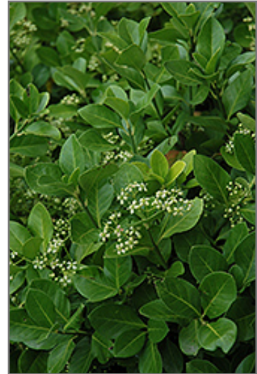
Manhattan Spreading Euonymus flowers

This shrub performs well in both full sun and full shade. It is very adaptable to both dry and moist locations, and should do just fine under average home landscape conditions. It is not particular as to soil type or pH. It is highly tolerant of urban pollution and will even thrive in inner city environments, and will benefit from being planted in a relatively sheltered location. This is a selected variety of a species not originally from North America.