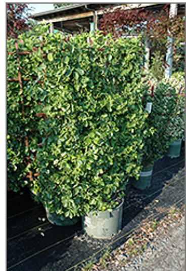
Manhattan Spreading Euonymus