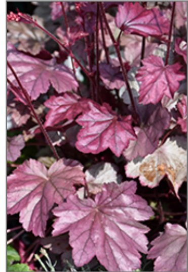
Stainless Steel Coral Bells foliage