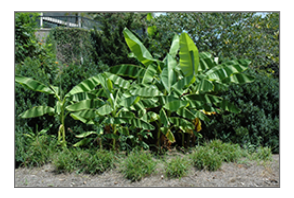
Ice Cream Banana

Ice Cream Banana is an herbaceous tropical perennial with an upright spreading habit of growth. Its wonderfully bold, coarse texture can be very effective in a balanced garden composition.