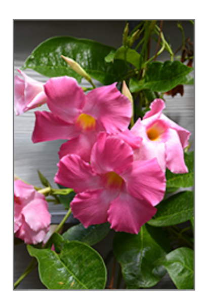
Sun Parasol Giant Pink Mandevilla flowers

When grown indoors, Sun Parasol Giant Pink Mandevilla can be expected to grow to be about 10 feet tall at maturity, with a spread of 24 inches. It grows at a medium rate, and under ideal conditions can be expected to live for approximately 20 years. This houseplant will do well in a location that gets either direct or indirect sunlight, although it will usually require a more brightly-lit environment than what artificial indoor lighting alone can provide. It requires an evenly moist well-drained soil for optimal growth. The surface of the soil shouldn't be allowed to dry out completely, and so you should expect to water this plant once and possibly even twice each week. Be aware that your particular watering schedule may vary depending on its location in the room, the pot size, plant size and other conditions; if in doubt, ask one of our experts in the store for advice. It is not particular as to soil type or pH; an average potting soil should work just fine. Be warned that parts of this plant are known to be toxic to humans and animals, so special care should be exercised if growing it around children and pets.