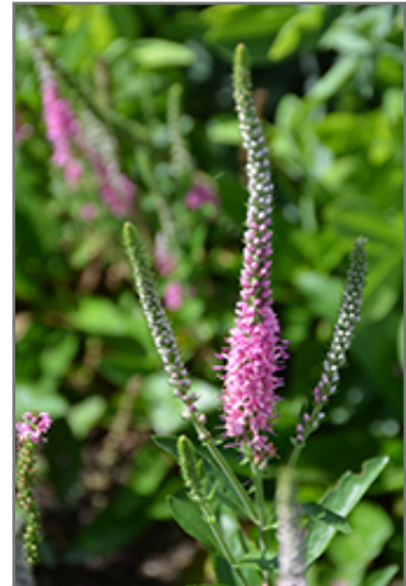
Perfectly Picasso Speedwell flowers