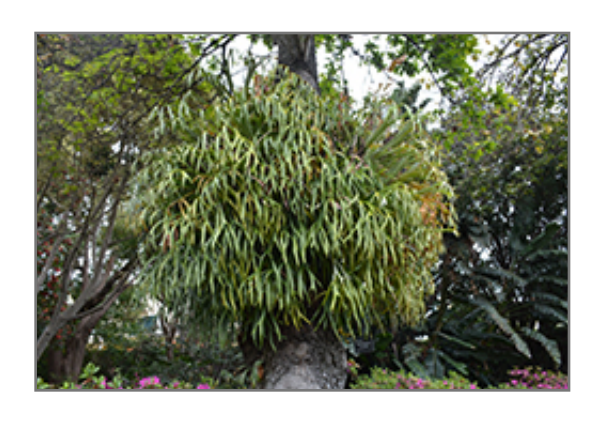
Staghorn Fern