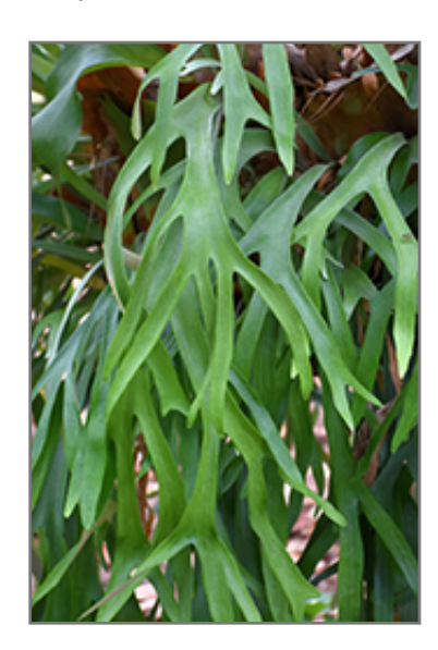
Staghorn Fern foliage