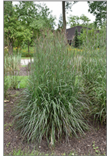
Blackhawks Bluestem in bloom