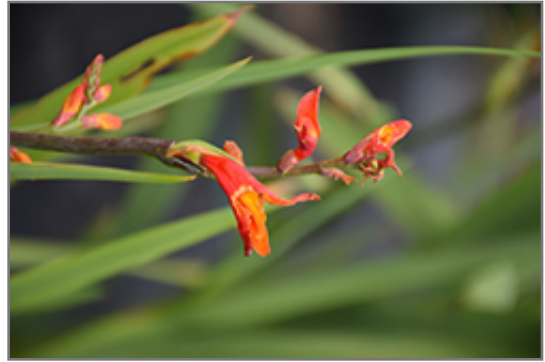
Orange Pekoe Crocosmia flowers