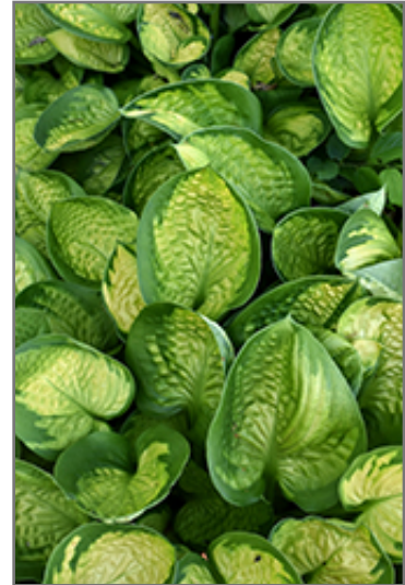
Rainforest Sunrise Hosta foliage

Rainforest Sunrise Hosta is recommended for the following landscape applications;