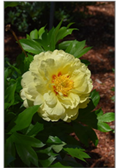
Bartzella Peony flowers