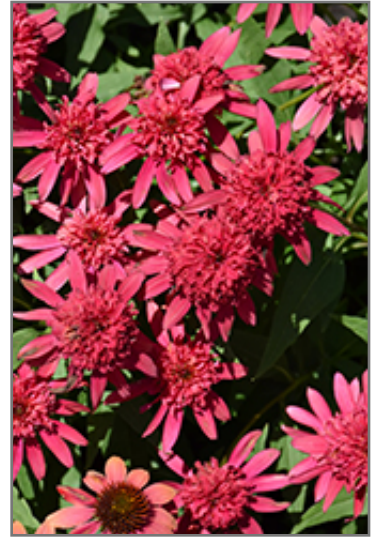
Double Scoop Raspberry Coneflower flowers