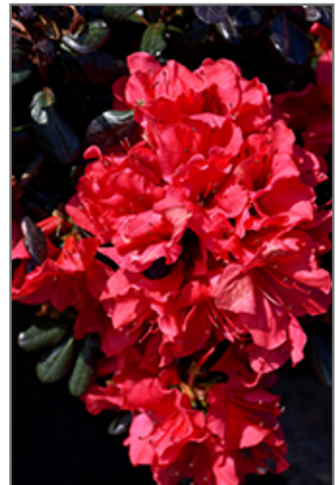
Johanna Azalea flowers