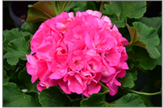
Americana Pink Geranium flowers