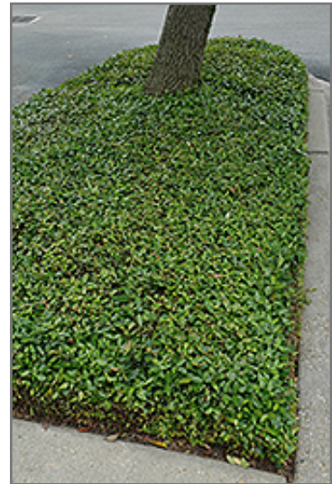
Asian Jasmine