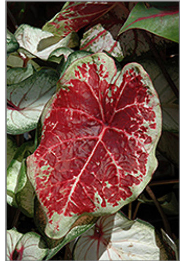
Raspberry Moon Caladium foliage