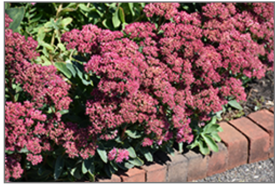
Carl Stonecrop in bloom

This is a relatively low maintenance plant, and is best cleaned up in early spring before it resumes active growth for the season. It is a good choice for attracting bees and butterflies to your yard, but is not particularly attractive to deer who tend to leave it alone in favor of tastier treats. It has no significant negative characteristics.