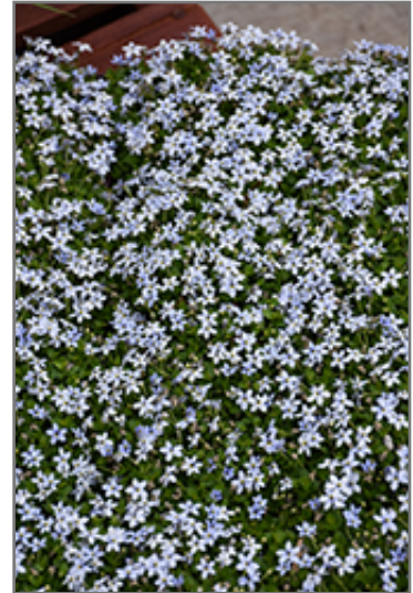
Blue Star Creeper flowers

Blue Star Creeper is recommended for the following landscape applications;