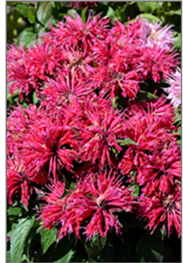
Cherry Pops Beebalm flowers

This variety forms a dense mound of cherry red flowers on well branched, strong stems, over lush dark green foliage that has an excellent resistance to powdery mildew; great for massing along borders