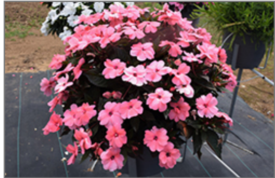
SunPatiens Compact Coral Pink New Guinea Impatiens in bloom