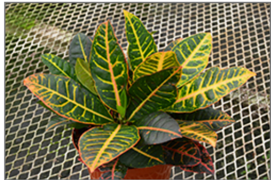
Petra Variegated Croton in full