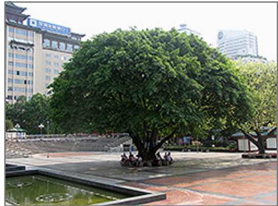
Indian Laurel Fig

This is a multi-stemmed evergreen houseplant with a more or less rounded form. This plant may benefit from an occasional pruning to look its best.