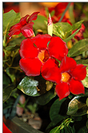
Rio Dark Red Mandevilla flowers

A beautiful variety, great for adding color to indoor plant collections; lovely mounded habit of lush, glossy green foliage, accented with large, deep red blooms; drought tolerant once established; deadhead to encourage new blooms