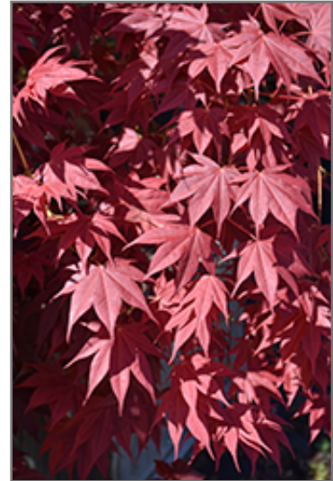
Tsukushi Gata Japanese Maple foliage

This shrub does best in full sun to partial shade. You may want to keep it away from hot, dry locations that receive direct afternoon sun or which get reflected sunlight, such as against the south side of a white wall. It prefers to grow in average to moist conditions, and shouldn't be allowed to dry out. It is not particular as to soil pH, but grows best in rich soils. It is somewhat tolerant of urban pollution. Consider applying a thick mulch around the root zone in winter to protect it in exposed locations or colder microclimates. This is a selected variety of a species not originally from North America.