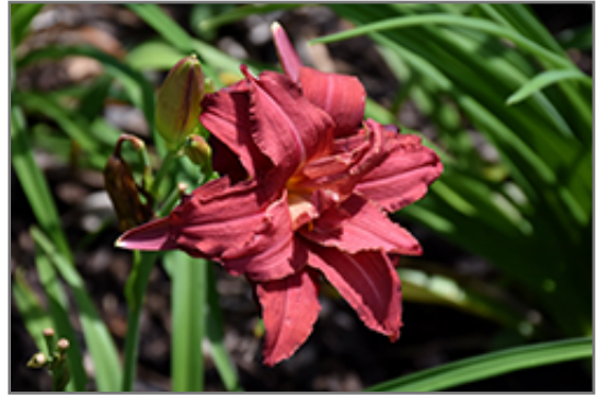
Double Pardon Me Daylily flowers

A distinct variety that is very floriferous, forming lovely, ruffled, double red flowers on arching stems all summer; a colorful addition in the landscape, or massed along borders