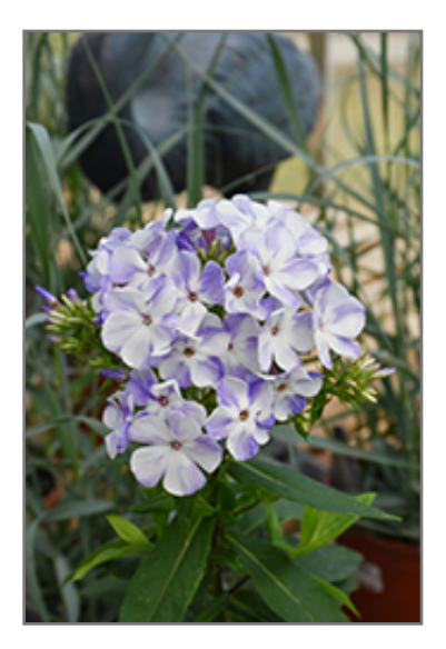
Flame Blue Garden Phlox flowers