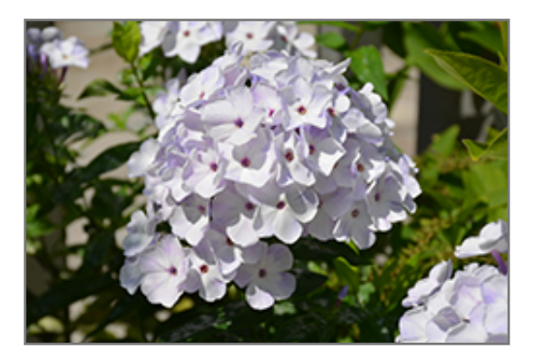
Flame Blue Garden Phlox flowers

Flame Blue Garden Phlox is a dense herbaceous perennial with an upright spreading habit of growth. Its medium texture blends into the garden, but can always be balanced by a couple of finer or coarser plants for an effective composition.