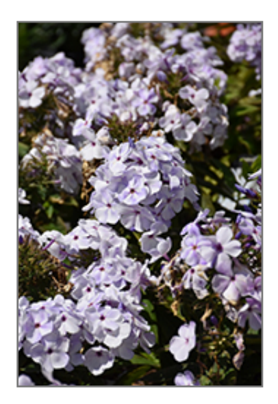
Flame Blue Garden Phlox flowers

3801 Alpine Ave. NW, Comstock Park, MI 49321 | (616) 784-0542 4321 28th Street SE, Kentwood, MI 49512 | (616) 942-5321 765 28th Street, Wyoming, MI 49509 | (616) 532-5934