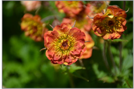
Cocktails Alabama Slammer Avens flowers