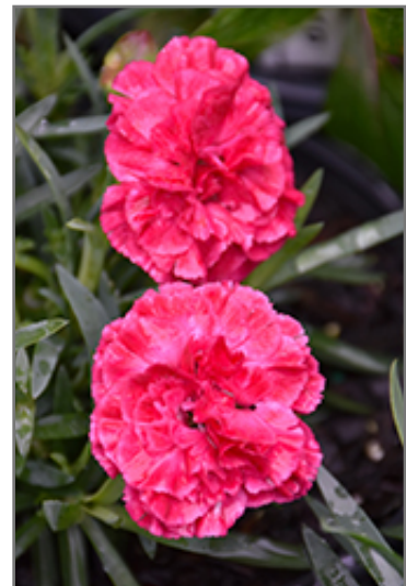
Fruit Punch Raspberry Ruffles Pinks flowers