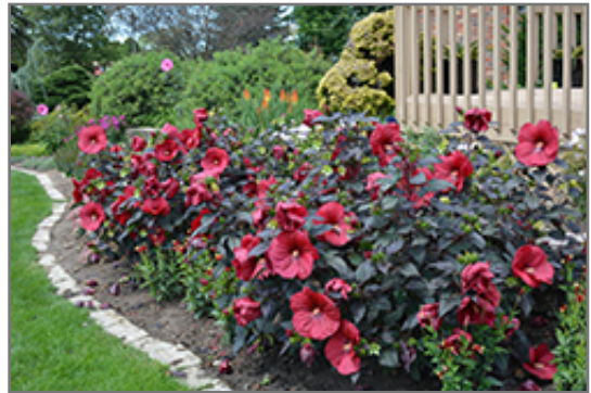
Summerific Holy Grail Hibiscus in bloom