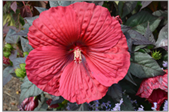
Summerific Holy Grail Hibiscus flowers