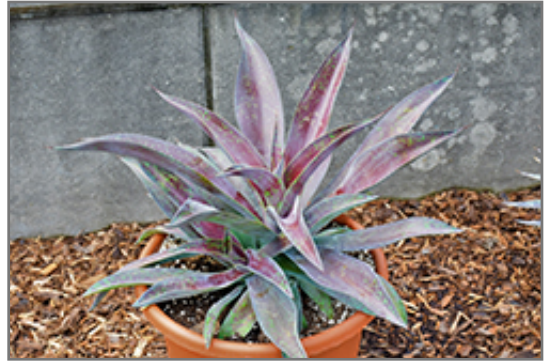
Mission to Mars Mangave

Mission to Mars Mangave will grow to be about 10 inches tall at maturity, with a spread of 22 inches. It grows at a fast rate, and under ideal conditions can be expected to live for approximately 5 years. As an herbaceous perennial, this plant will usually die back to the crown each winter, and will regrow from the base each spring. Be careful not to disturb the crown in late winter when it may not be readily seen!