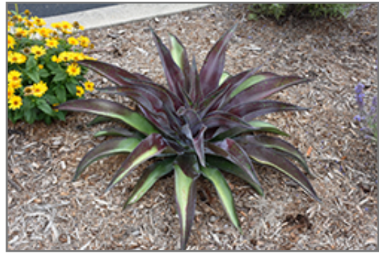
Mission to Mars Mangave

Mission to Mars Mangave is recommended for the following landscape applications;