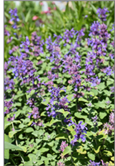
Early Bird Catmint flowers

Early Bird Catmint is recommended for the following landscape applications;