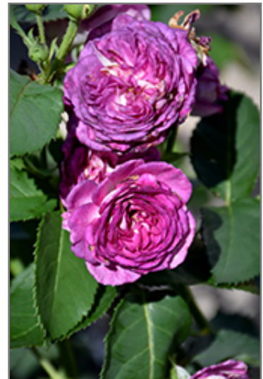
Arctic Blue Rose flowers