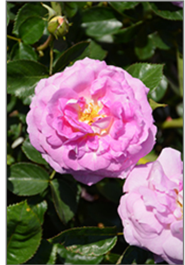
Arctic Blue Rose flowers