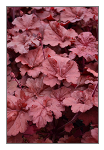
Primo Mahogany Monster Coral Bells foliage

Primo Mahogany Monster Coral Bells is a dense herbaceous evergreen perennial with tall flower stalks held atop a low mound of foliage. Its relatively fine texture sets it apart from other garden plants with less refined foliage.