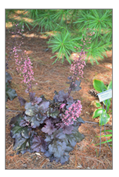
Primo Mahogany Monster Coral Bells in bloom