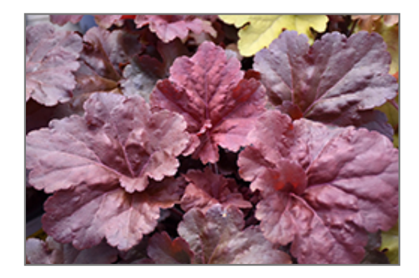
Primo Mahogany Monster Coral Bells foliage

3801 Alpine Ave. NW, Comstock Park, MI 49321 | (616) 784-0542 4321 28th Street SE, Kentwood, MI 49512 | (616) 942-5321 765 28th Street, Wyoming, MI 49509 | (616) 532-5934