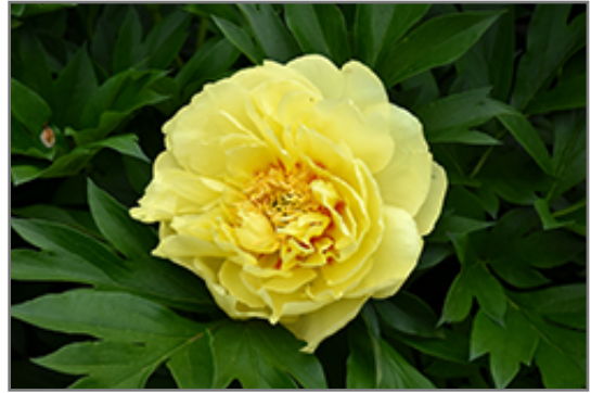
Garden Treasure Peony flowers

Garden Treasure Peony is recommended for the following landscape applications;