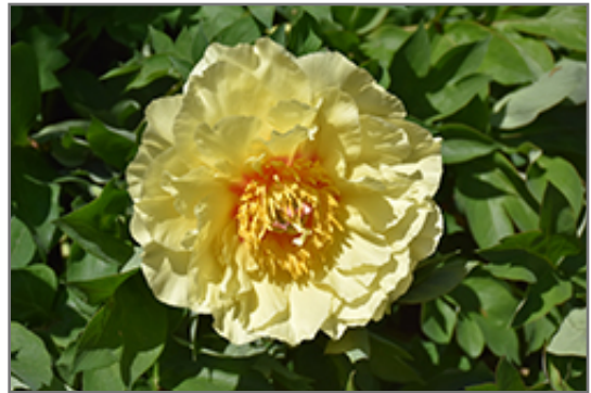
Garden Treasure Peony flowers