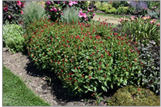
Little Redhead Indian Pink in bloom

Little Redhead Indian Pink will grow to be about 20 inches tall at maturity, with a spread of 24 inches. When grown in masses or used as a bedding plant, individual plants should be spaced approximately 20 inches apart. Its foliage tends to remain dense right to the ground, not requiring facer plants in front. It grows at a fast rate, and under ideal conditions can be expected to live for approximately 5 years. As an herbaceous perennial, this plant will usually die back to the crown each winter, and will regrow from the base each spring. Be careful not to disturb the crown in late winter when it may not be readily seen!