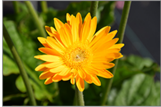
Garvinea Sweet Smile Gerbera flowers

Garvinea Sweet Smile Gerbera is recommended for the following landscape applications;