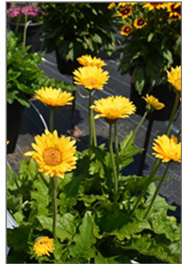
Garvinea Sweet Smile Gerbera in bloom