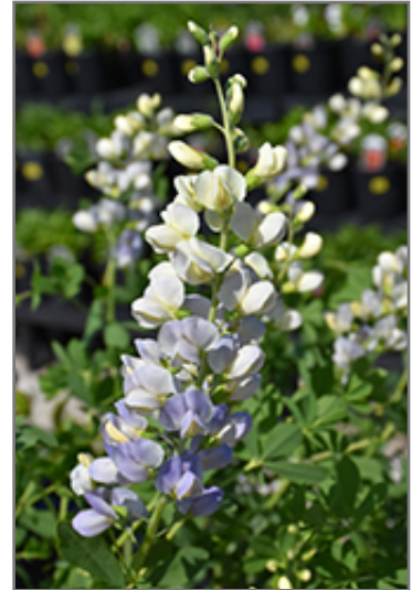
Lunar Eclipse Prairieblues False Indigo flowers

Spectacular spikes of butter-cream pea-flowers progress to lavender, then mature to dark purple-blue, above attractive blue-green foliage in early summer; an outstanding vertical floral display as an accent in the garden or landscape