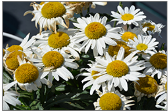
Madonna Shasta Daisy flowers