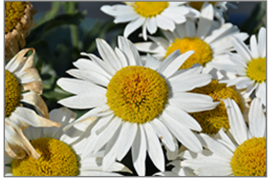
Madonna Shasta Daisy flowers

Madonna Shasta Daisy is recommended for the following landscape applications;