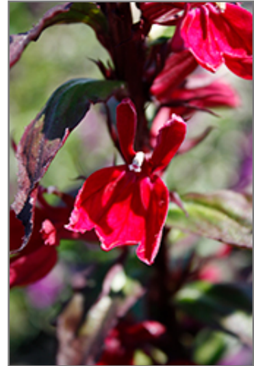
Starship Burgundy Lobelia flowers

Starship Burgundy Lobelia is recommended for the following landscape applications;