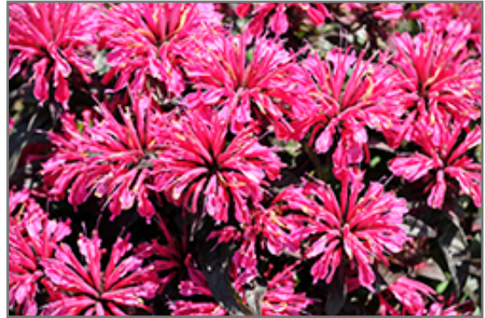
Sugar Buzz Berry Taffy Beebalm flowers

This variety forms a well branched, upright mound of hot raspberry pink flowers on strong stems; glossy dark green foliage has an excellent resistance to powdery mildew; great for massing along borders