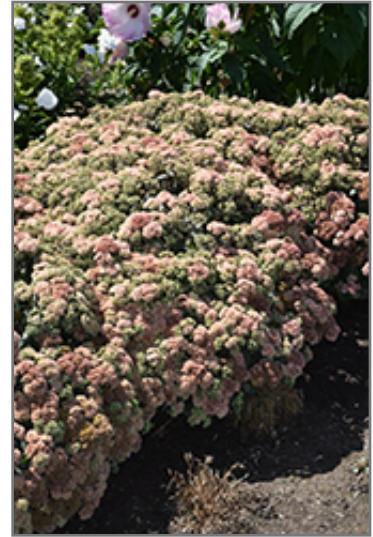
Rock 'N Grow Coraljade Stonecrop in bloom

This is a relatively low maintenance plant, and is best cleaned up in early spring before it resumes active growth for the season. It is a good choice for attracting butterflies to your yard, but is not particularly attractive to deer who tend to leave it alone in favor of tastier treats. It has no significant negative characteristics.