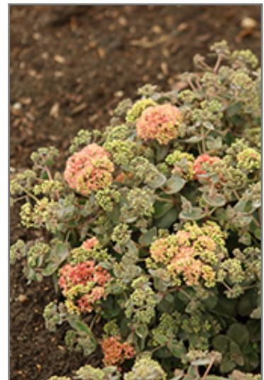
Rock 'N Grow Coraljade Stonecrop flowers