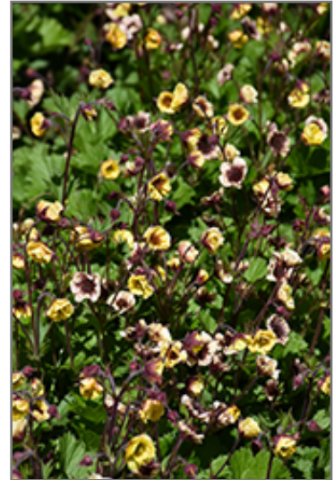
Tempo Yellow Avens flowers

Tempo Yellow Avens is recommended for the following landscape applications;