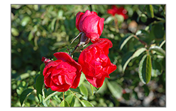
Flower Carpet Scarlet Rose flowers

3801 Alpine Ave. NW, Comstock Park, MI 49321 | (616) 784-0542 4321 28th Street SE, Kentwood, MI 49512 | (616) 942-5321 765 28th Street, Wyoming, MI 49509 | (616) 532-5934