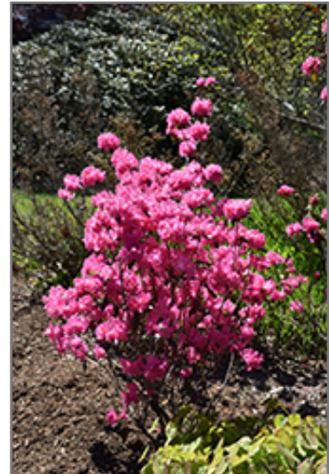
Landmark Rhododendron in bloom