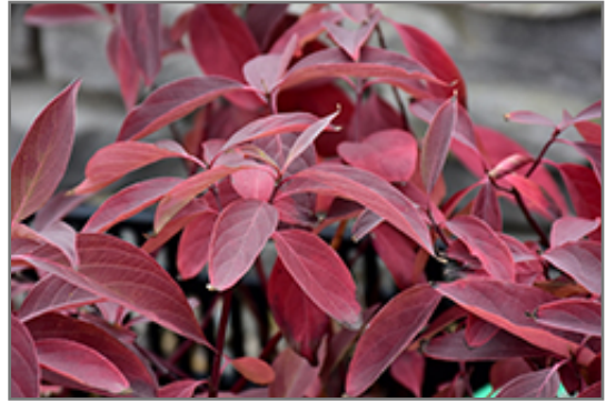
Arctic Fire Red Twig Dogwood in fall

This shrub does best in full sun to partial shade. It is an amazingly adaptable plant, tolerating both dry conditions and even some standing water. It is not particular as to soil type or pH. It is highly tolerant of urban pollution and will even thrive in inner city environments. This is a selection of a native North American species.