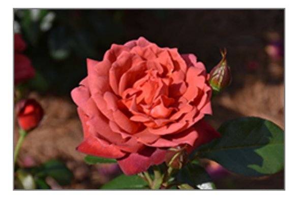
Hot Cocoa Rose flowers