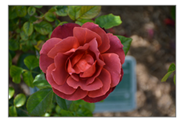
Hot Cocoa Rose flowers

3801 Alpine Ave. NW, Comstock Park, MI 49321 | (616) 784-0542 4321 28th Street SE, Kentwood, MI 49512 | (616) 942-5321 765 28th Street, Wyoming, MI 49509 | (616) 532-5934