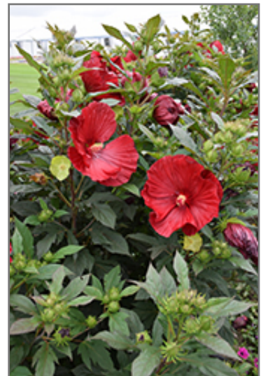
Summerific Cranberry Crush Hibiscus flowers