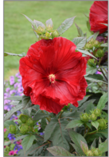
Summerific Cranberry Crush Hibiscus flowers