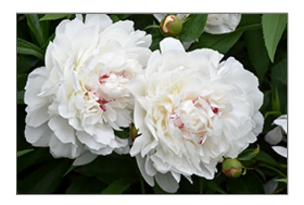
Festiva Maxima Peony flowers