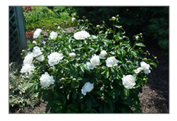
Festiva Maxima Peony in bloom