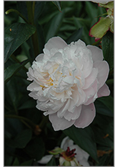
Lady Alexandra Duff Peony flowers